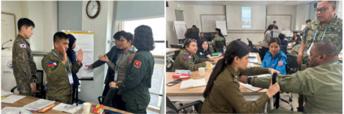
Participants interact during learning activities

The course also included a two-day session on training methodology, supported by the United Nations Institute for Training and Research (UNITAR), which covered the training cycle, lesson design, training evaluation and practical tips on how to develop lessons and deliver training in an effective way.