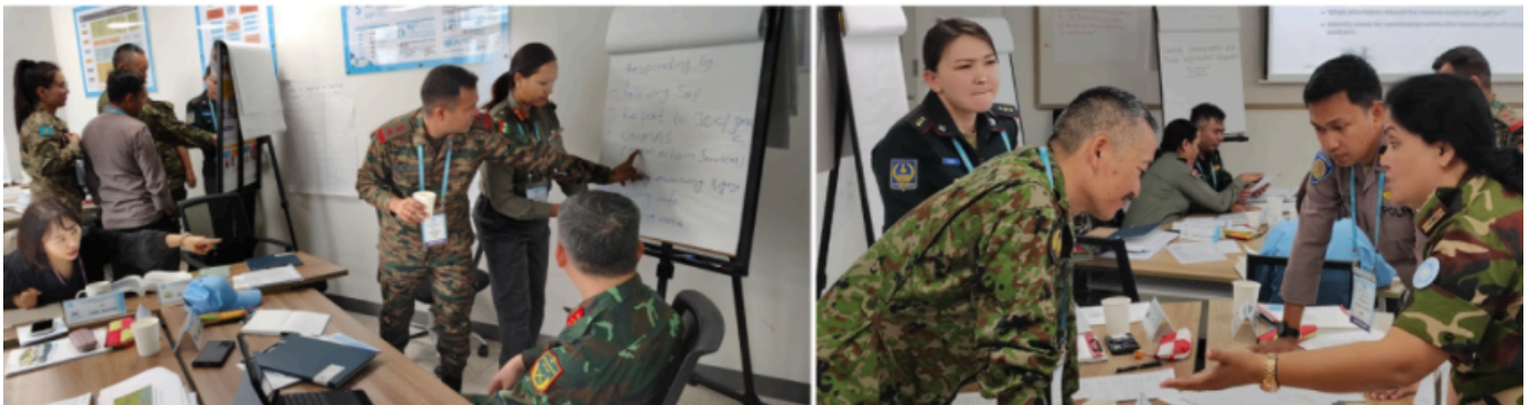
CPTM TOT participants engage in learning activities

Participant trainers facilitated one lesson each with support from ITS, making use of the new learning support materials through learning activities, media, slides and evaluation question banks. Participants remarked on how "the course effectively used group discussions, role-plays and interactive exercises which kept participants highly engaged" and "fostered an environment of shared insights and best practices from different countries". Participants also highlighted how valuable it is for "continued interactions between ITS and Member State national trainers" and the added value from ITS facilitators who were able to "connect theory with real-world application for a more impactful learning environment".