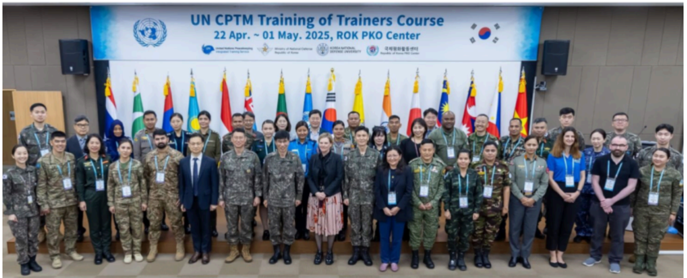
UN CPTM TOT Asia and Pacific Group Photo